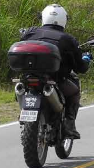
On the Keningau-Kimanis road.

Do you know a road like this? Don't keep it secret!